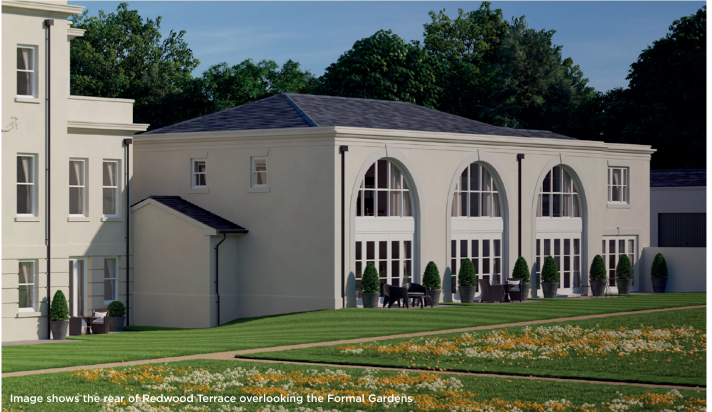
Image shows the rear of Redwood Terrace overlooking the Formal Gardens

No. 4 Redwood Terrace is a three bedroom end-of-terrace home with bi-fold doors that offer access directly onto the formal gardens. It has two allocated parking spaces in the quiet front courtyard.